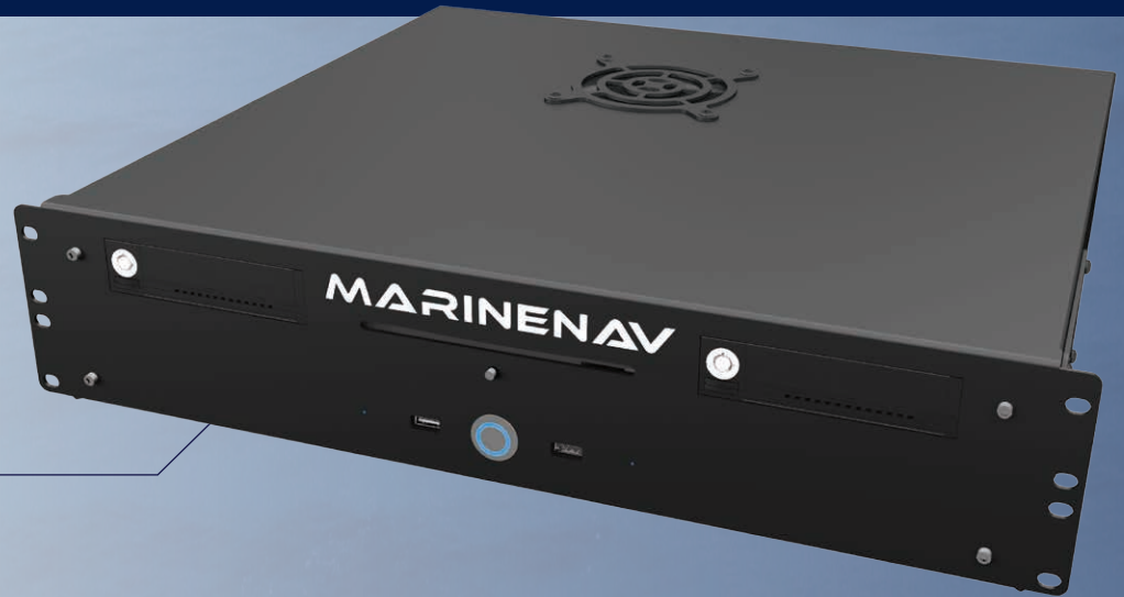
FRONT VIEW OF LEVIATHAN 19i

Built North Atlantic Tough Trusted Everywhere