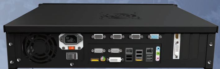
BACK VIEW OF LEVIATHAN 19i