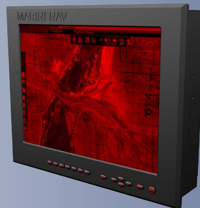
Red Monochrome Night Mode View

* Product must be registered within first warranty year.