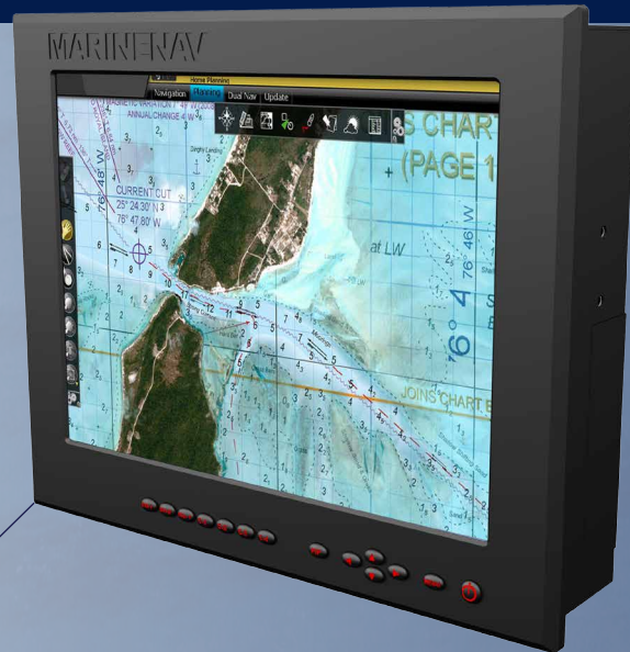
FRONT VIEW OF CG ELITE 15 DISPLAY

Built North Atlantic Tough Trusted Everywhere