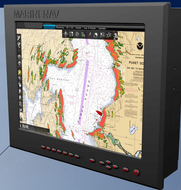
FRONT VIEW OF BRIDGEVIEW 15 DISPLAY