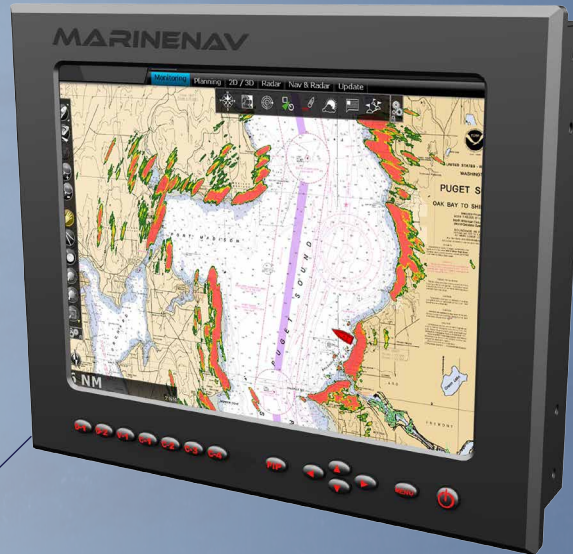
FRONT VIEW OF BRIDGEVIEW 12 DISPLAY