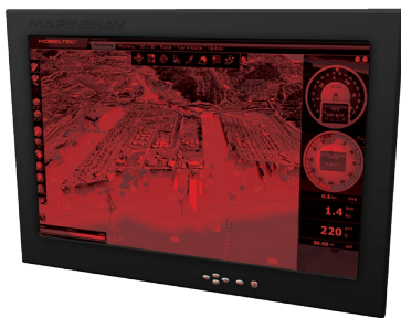
Red Monochrome Night Mode View (24" Monitor)

While we strive to ensure the accuracy of all items and descriptions in this document, this is not always possible. Specifications, options, and availability subject to change with out notice. Errors and omissions excepted. We reserve the right to limit quantities.