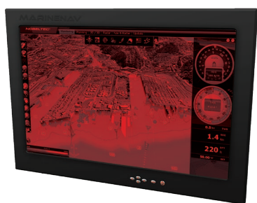
Red Monochrome Night Mode View (24" Monitor)

While we strive to ensure the accuracy of all items and descriptions in this document, this is not always possible. Specifications, options, and availability subject to change with out notice. Errors and omissions excepted. We reserve the right to limit quantities.