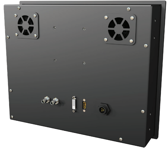
Back view of Mariner 15" display