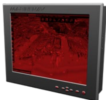
Red Monochrome Night Mode View

MarineNav Ltd. is an ISO 9001:2015 certified company. Our certified Quality Management System ensures that each unit we produce adheres to the strictest standards and complies with customer requirements. While we strive to ensure the accuracy of all items and descriptions in this document, this is not always possible. Specifications, options, and availability are subject to change without notice. Errors and omissions excepted. We reserve the right to limit quantities.