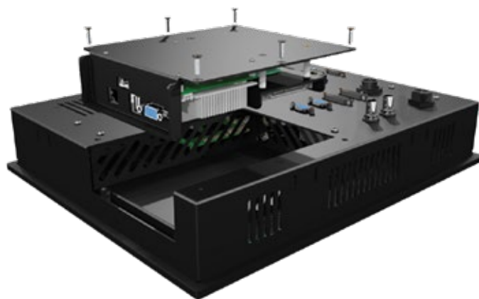
Back view showing optional field swappable integrated computer