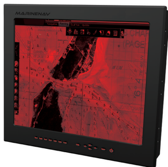
Red Monochrome Night Mode View

MarineNav Ltd. is an ISO 9001:2015 certified company. Our certified Quality Management System ensures that each unit we produce adheres to the strictest standards and complies with customer requirements. While we strive to ensure the accuracy of all items and descriptions in this document, this is not always possible. Specifications, options, and availability are subject to change without notice. Errors and omissions excepted. We reserve the right to limit quantities.