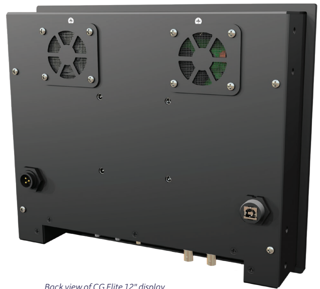
Back view of CG Elite 12" display