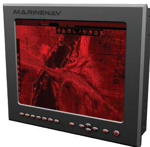
Red Monochrome Night Mode View

While we strive to ensure the accuracy of all items and descriptions in this document, this is not always possible. Specifications, options, and availability subject to change with out notice. Errors and omissions excepted. We reserve the right to limit quantities.